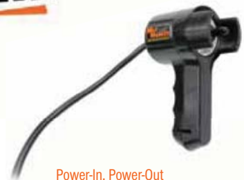
Power-In, Power-Out Remote Control