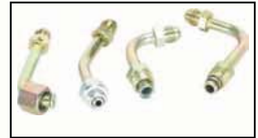
35 SERIES ADAPTER KIT REQUIRED. SEE APPLICATION CHART ON PAGE 7.